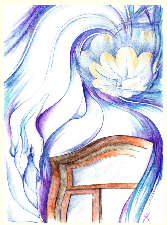
"...but I only knew its outside appearance."