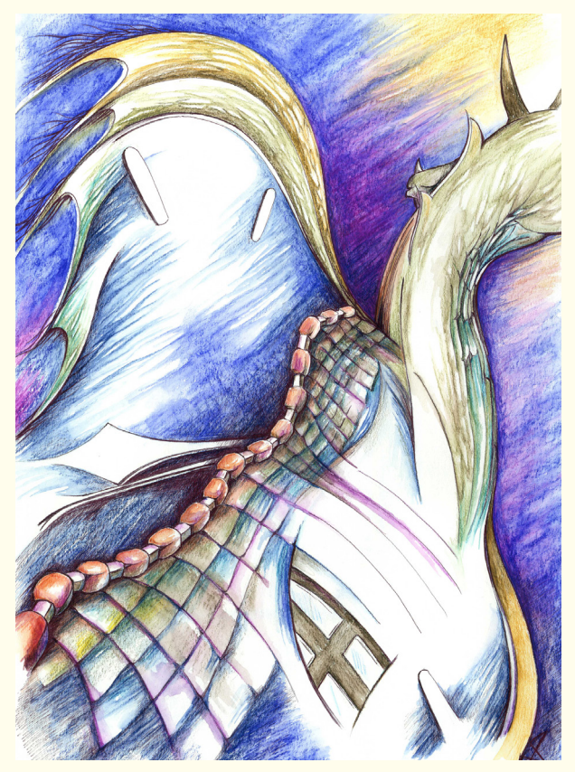
"...and a roof that made me think of a sleeping dragon when I was a little girl..."