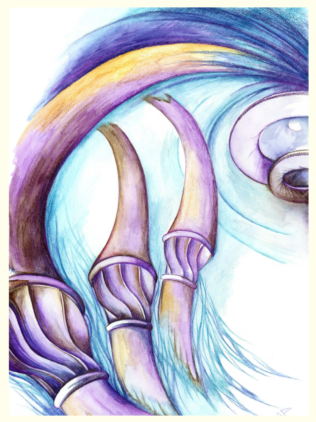
"...was a well-known hotel listed in all the tourist guides..."