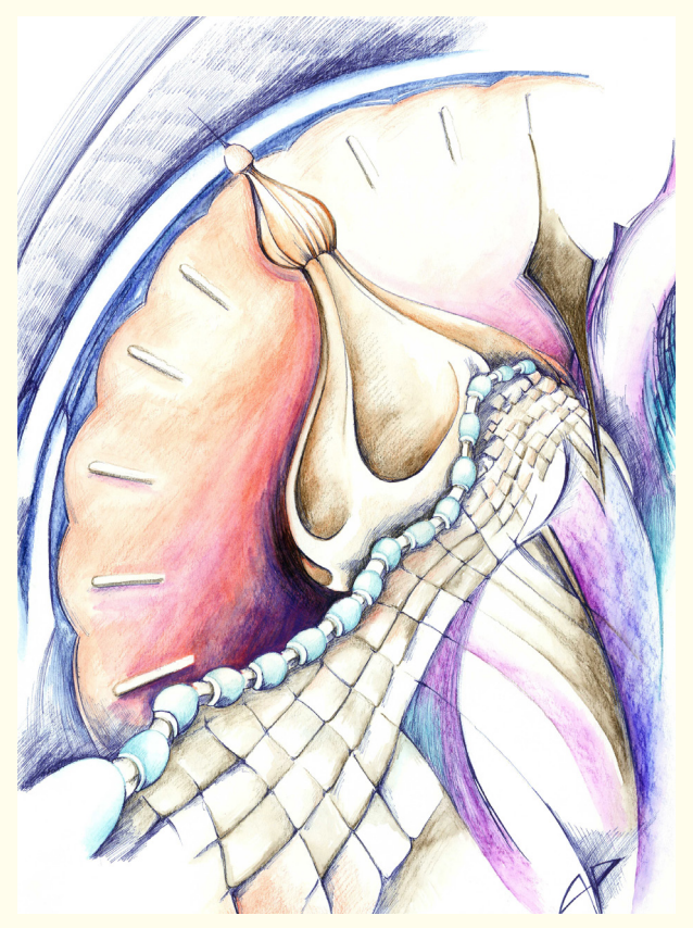
"I knew that the five-storey building, with its sinuous façade..."